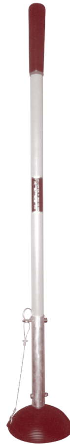
Lightweight Sphere Handler Model LSH